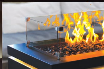
Glass Wind Guard

The Halo Gas Fire Pit Linear edition has been designed with a linear patio layout front of mind. The clean modern appearance of this fire pit accents perfectly with most outdoor furniture sets. Perfect for aligning with patio sofas and outdoor dinner tables. It's low and slim profile allow it to be both subtle and impressive.