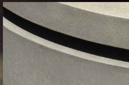
Natural Grey Concrete Finish

The Halo Gas Fire Pit Concrete straddles the line between classic and modern. It builds on the aesthetic strengths of our original Halo design and turns up the quality with a detailed natural grey concrete finish. Add a touch of class to your backyard composition with this beautifully designed fire pit.