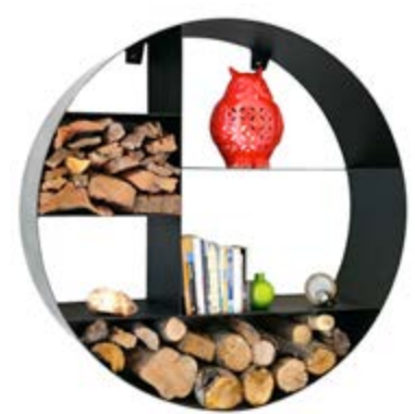
Log Storage | The Helios