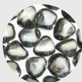
MQG5ZG Zircon Glacier Ice Glass