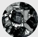
MQG5B Black Ember Glass