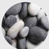
MQSTONE Decorative Stones