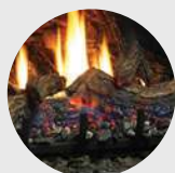
MQLOGF26 Fibre Split Oak