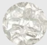
MQG5W White Ember Glass