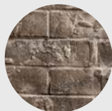
IDV26RL Traditional Brick Liner