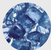
MQG5A Cobalt Ember Glass