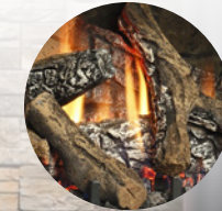
LOGC200 Cast Split Oak