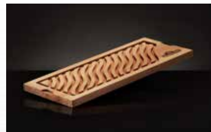
CEDAR INFUSION PLANK