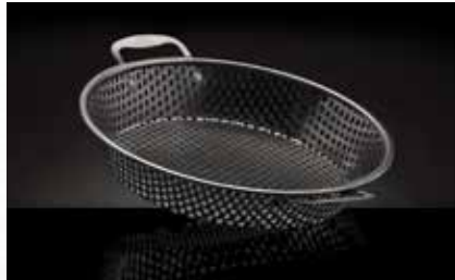
STAINLESS STEEL GRILLING WOK