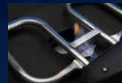
Dual Stainless Steel Burners for Direct or Indirect Grilling