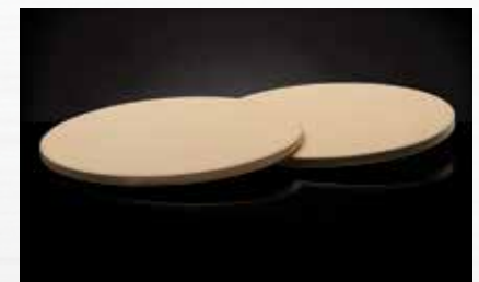
10" PERSONAL SIZED PIZZA / BAKING STONE SET