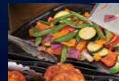
Optional Porcelain-enameled Cast Iron Reversible Griddle