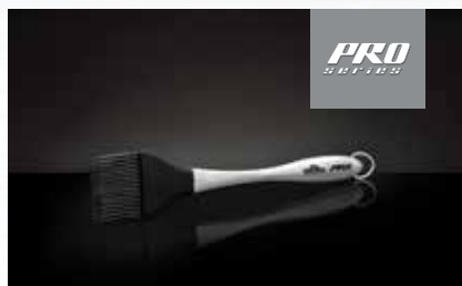
PRO SILICONE BASTING BRUSH