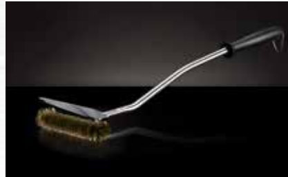
BRASS BRISTLE WIDE GRILL BRUSH