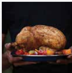
High-Top Lid for Larger Cuts of Meat