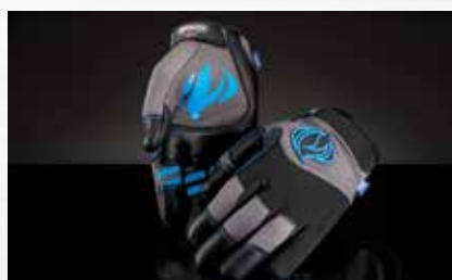
MULTI-USE TOUCHSCREEN GLOVES