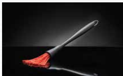
PRO SILICONE BASTING MOP