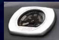
ACCU-PROBE™ Temperature Gauge

Assembled size for cart kit with side shelves only: 30 ½" w x 20 ½" d x 29" h (77.5 cm w x 52 cm d x 74 cm h)