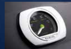
ACCU-PROBE™ Temperature Gauge