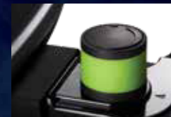
Adjustable Easy to Set Heat Control