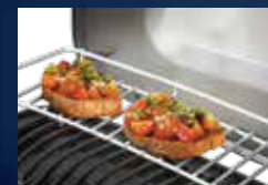
Optional Warming Rack (Fits PRO285 only) 71285