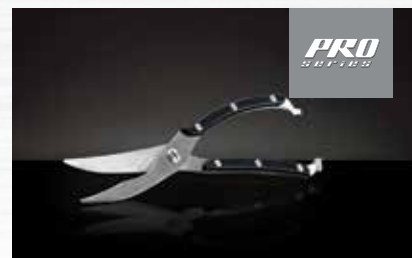
PRO POULTRY SHEARS