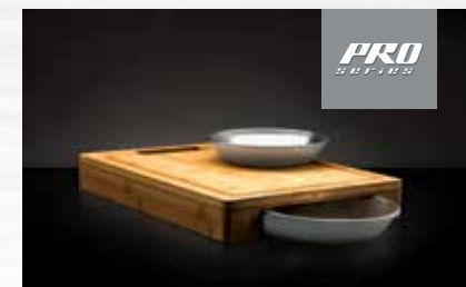
PRO CUTTING BOARD AND BOWL SET