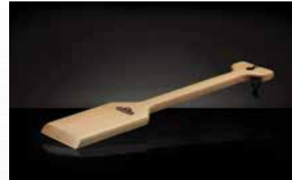
CEDAR GRILL SCRAPER