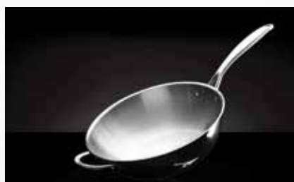
STAINLESS STEEL WOK