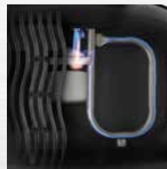
Advanced Cooking System