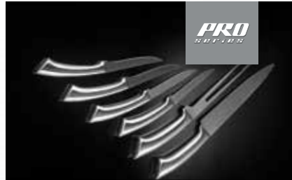
PROFESSIONAL KNIFE / CARVING SET