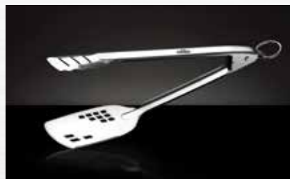
STAINLESS STEEL SPATUTONG