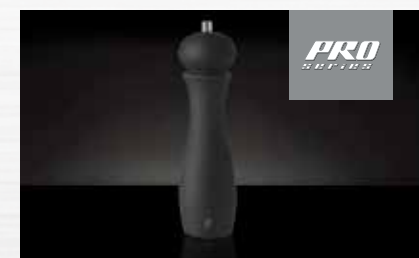
SALT AND PEPPER GRINDERS