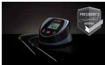
ACCU-PROBE™ BLUETOOTH™ THERMOMETER