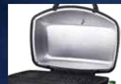
High-Top Cast Aluminum Lid