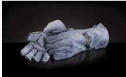
GENUINE LEATHER BBQ GLOVES