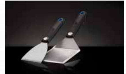
2 PIECE PLANCHA TOOLSET