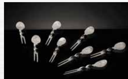
APPETIZER SERVING SET AND CORN FORKS