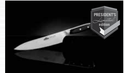
EXECUTIVE CHEF KNIFE