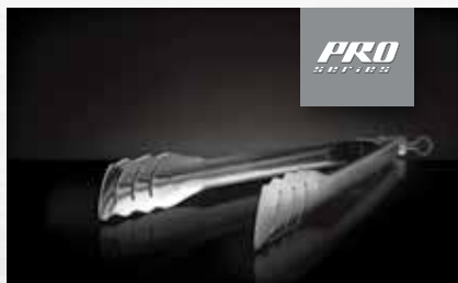
STAINLESS STEEL EASY LOCKING TONGS