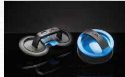
GOURMET BURGER PRESS KIT