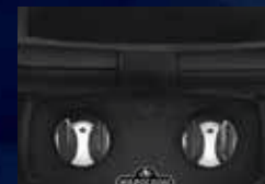
Ergonomic Control Knobs