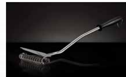
BRISTLE-FREE WIDE GRILL BRUSH