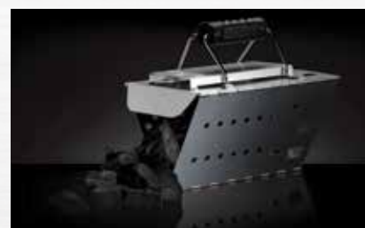
JETFIRE™ CHIMNEY STARTER