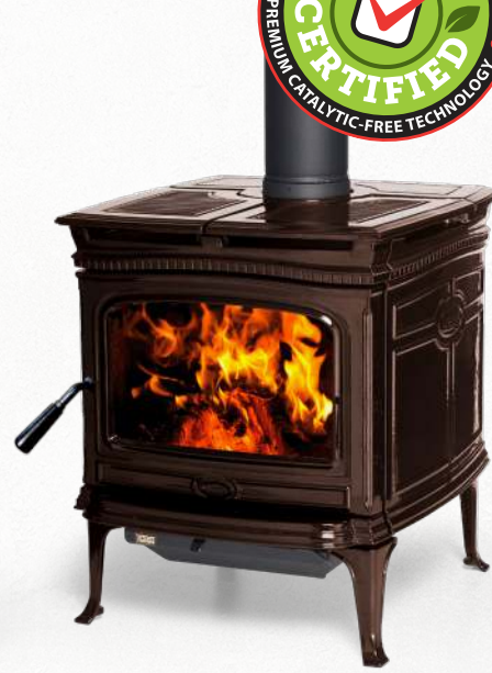
ALDERLEA T5 CLASSIC LE