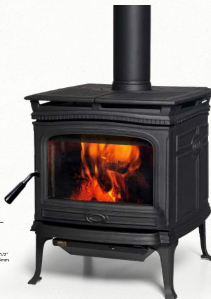
ALDERLEA T5 LE