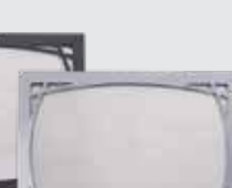
Artisan Brushed Nickel