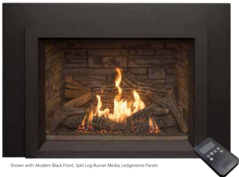
Shown with: Modern Black Front, Split Log Burner Media, Ledgestone Panels