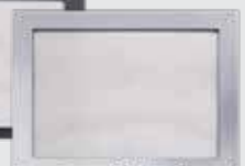
Modern Brushed Nickel