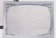
Artisan Brushed Nickel