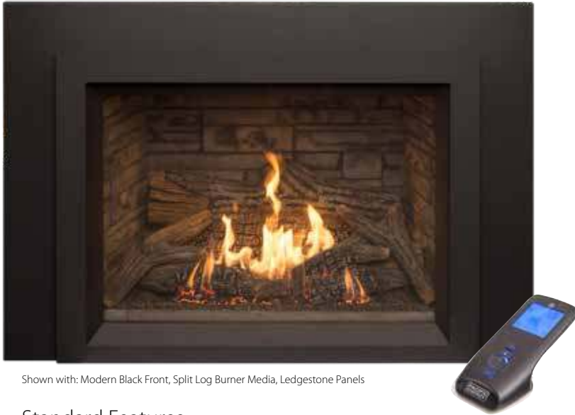
Shown with: Modern Black Front, Split Log Burner Media, Ledgestone Panels